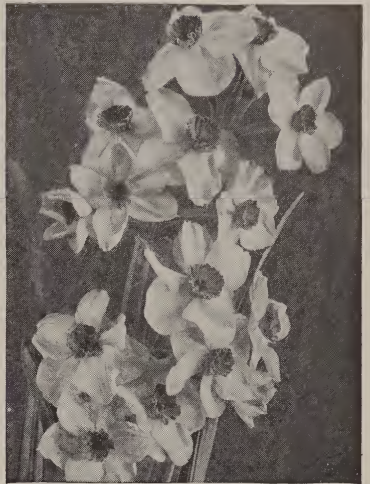
Poetaz, Orange Cup